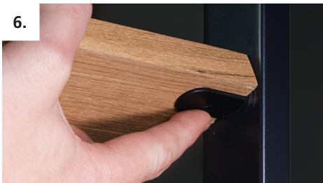
Insert cover cap if required