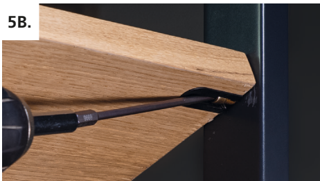
For applications with screws, the shelf is also laid into place. In addition, the pre-installed screws are tightened