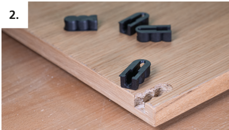
Machine or drill the connector on the CNC machine