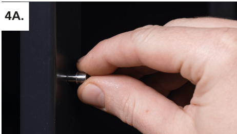
Insert shelf support into the boreholes to allow adjustment of the shelf without tools