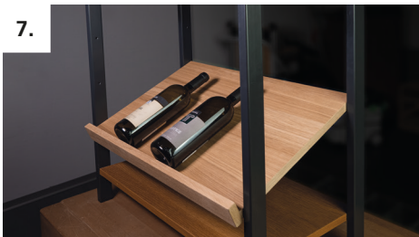
The inclined shelf is now secured against slipping or lifting off