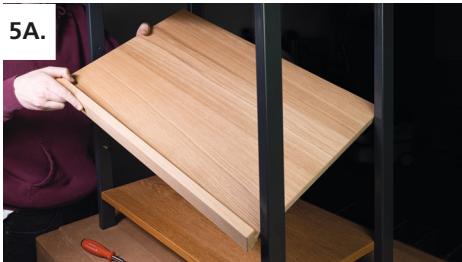
If shelf supports are inserted, the shelf can now be pressed into the inserted shelf supports from above