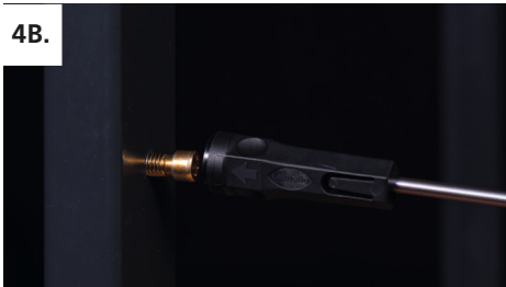
Alternative for load-bearing shelves: Insert Cabineo screw